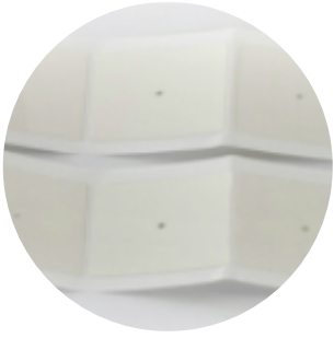
Adhesive Transfer Pad (5 pack)