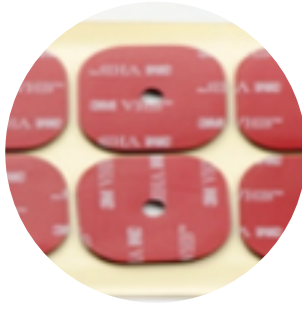
VHB, Puck, Freedom Micro (5 pack)