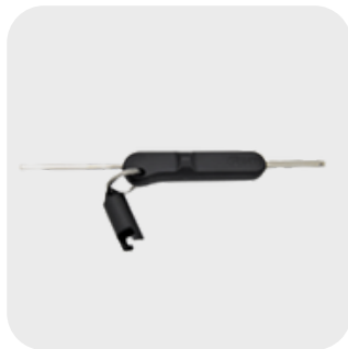
Part #M0495 FMII Tool