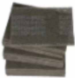
Part #M0672 Buffer Pad